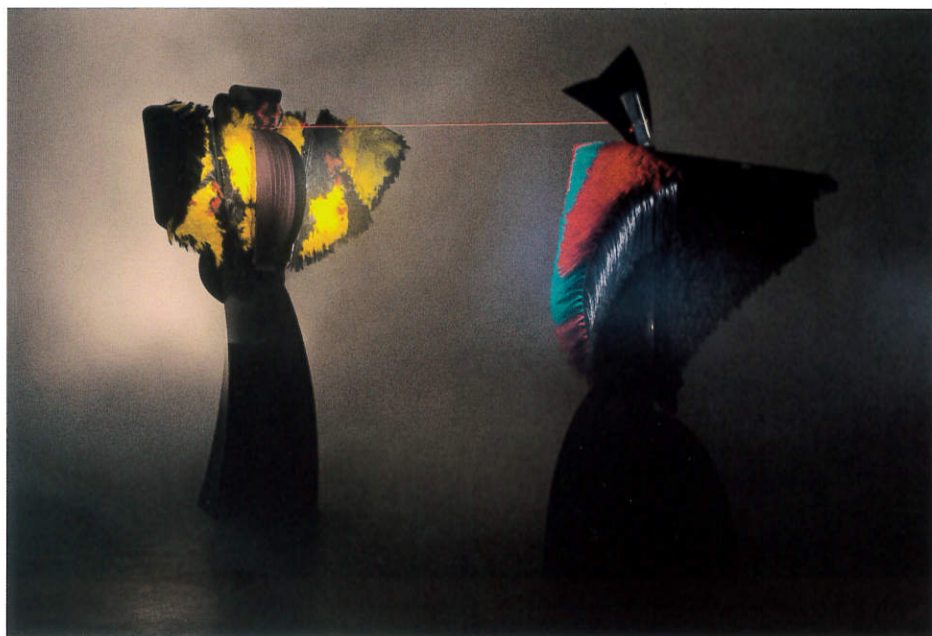
1. Conjunction of Opposites: Woman of War and Lady of the Wild Things , 1983–86, Liliane Lijn (b. 1939), installation of two mixed-media performing sculptures. Rodeo (price on application)

Melanie Gerlis selects her highlights of the fair