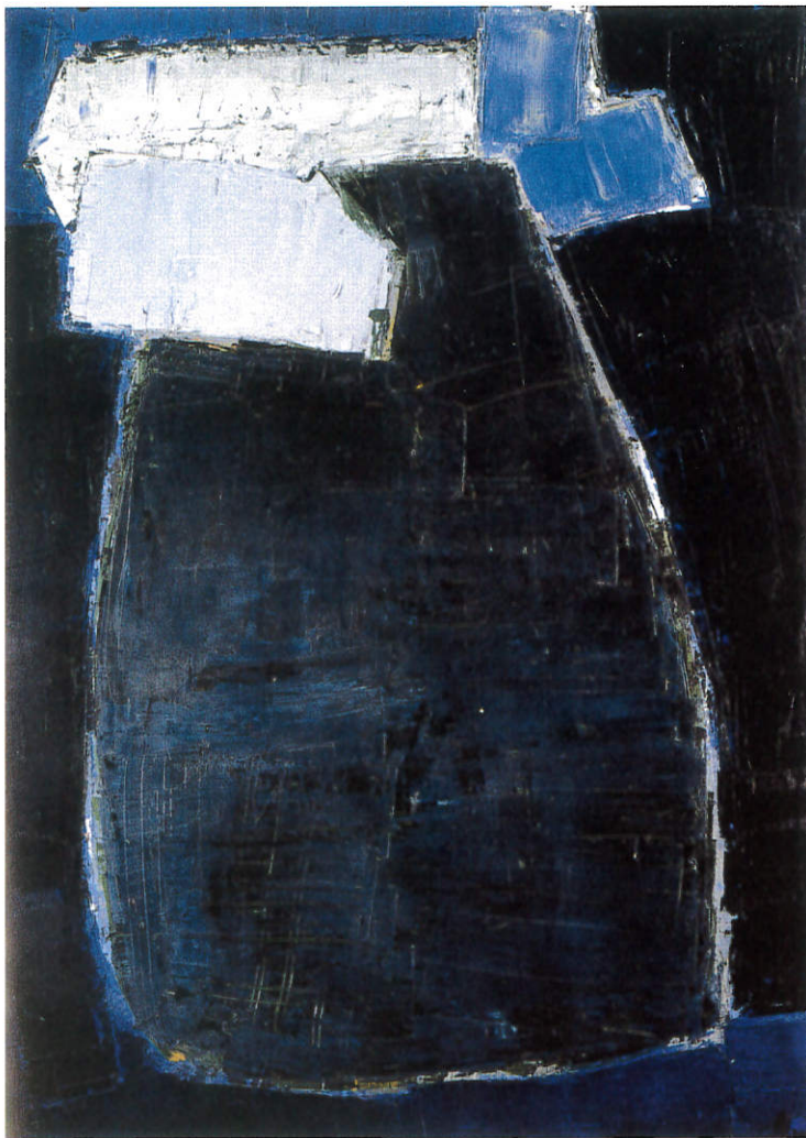
3. Grande Composition Bleue , 1950–51, Nicolas de Staël (1914–55), oil on Masonite, 200 × 150cm. Applicat-Prazan (price on application)

Guyana-born British painter Frank Bowling, is included in one of 24 projects in the fair's 'Feature' section of solo or curated presentations. Hales Gallery brings six of Bowling's previously unshown Cathedral Paintings from the 1980s, inspired by Evelyn Waugh's novel A Handful of Dust (1934) and built up with materials and objects through a process Bowling refers to as 'cooking' ($200,000–$400,000; Fig. 2). Bowling's first major retrospective has just opened at Tate Britain (until 26 August), while Hales also has a solo show in its London gallery ('More Land than Landscape', until 22 June). In the main fair, Luxembourg & Dayan brings several significant modern works, including Domenico Gnoli's rare, mature work Sofa (1968, price on application). This showed in Gnoli's first US exhibition, at Sidney Janis Gallery in 1969, just before the artist died.